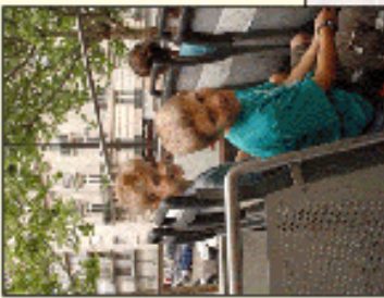
Notre Dame Cathedral

Le Tour Open is a great way to see many Paris sights in one day.