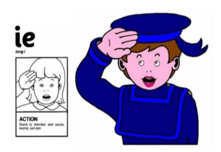
ie e.g. When I had a picnic, I tried some warm pie and it tasted great.