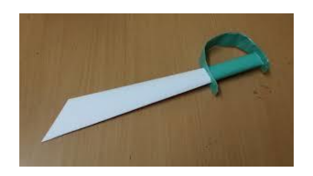
<u>Day 1 Activity:</u> Making pirate props